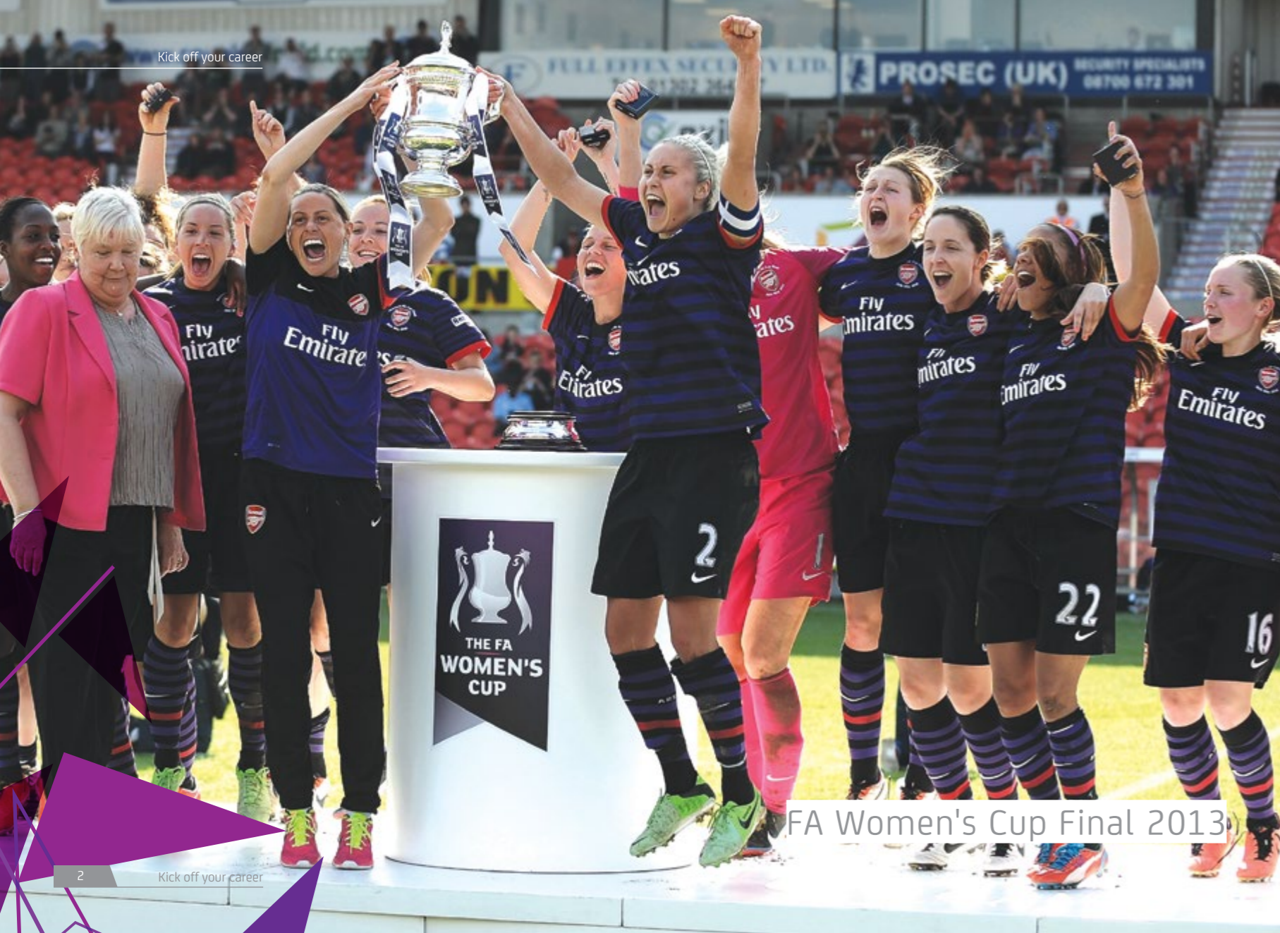
FA Women's Cup Final 2013