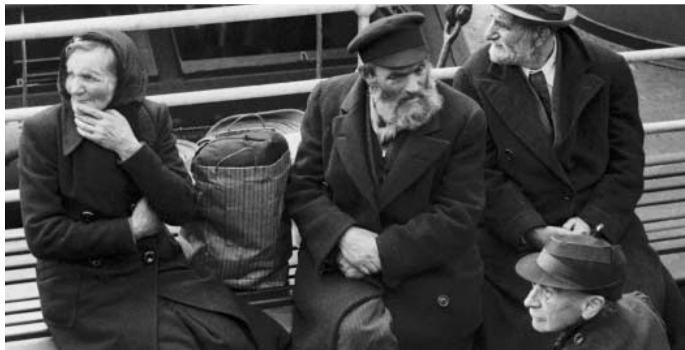
Polish Refugees, 1939

1 x 30-minute programme 1862156441 £9.99*